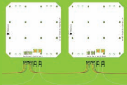
Connection of Tile