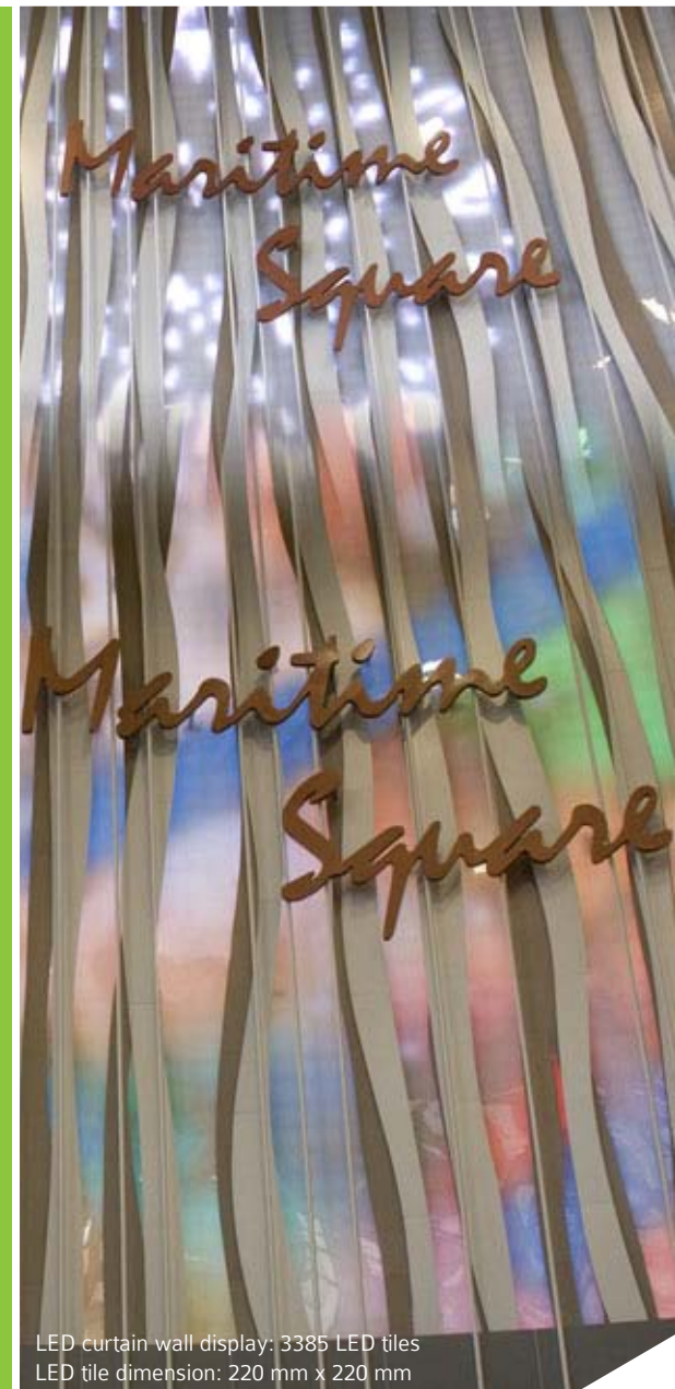
LED curtain wall display: 3385 LED tiles LED tile dimension: 220 mm x 220 mm